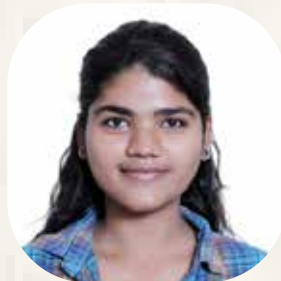
SHREE CHAITANYA 1NH24EE094