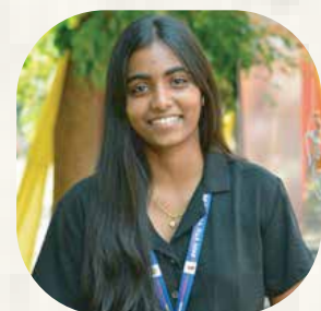
A SPOORTHI 1NH24EE001